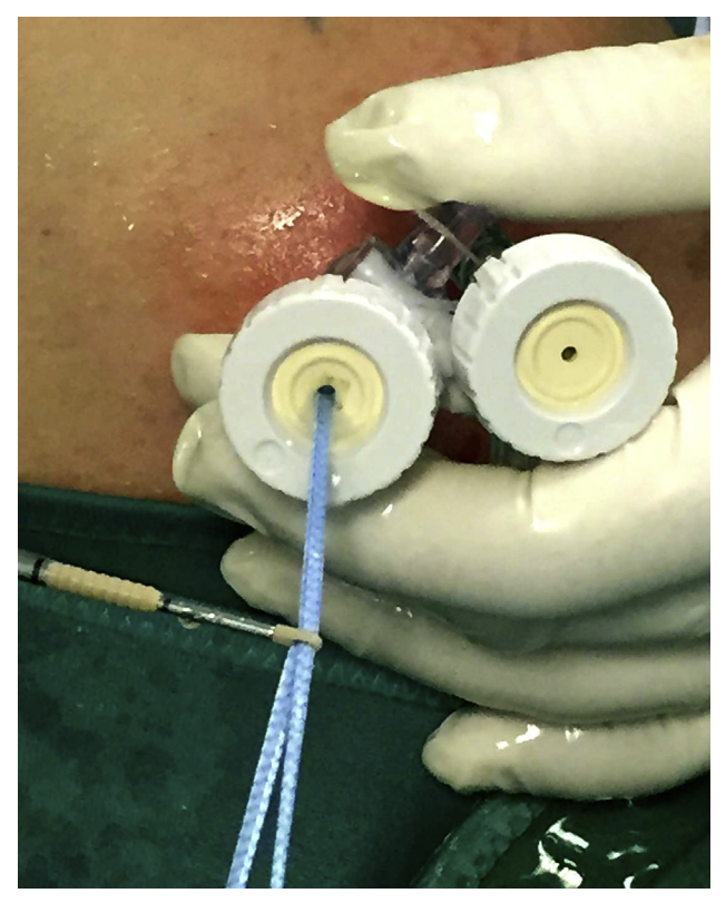
Fig 3. Knotless nonabsorbable suture anchor (3.5-mm PushLock) loaded with multistrand tape, the 2 ends of the tape are seen coming out from the anteroinferior portal.

After surgical repair, the shoulder was immobilized in a brace with the arm in 0^{\circ} of abduction and internal rotation for 4 weeks. The rehabilitation program consisted of 4 phases. The first phase was initiated in the fifth week, using both shoulder passive ROM and active ROM exercises to increase joint mobility. In the second phase, at 6 to 8 weeks, the aim was recovery of full ROM. The third phase, at 8 to 9 weeks, was focused on the recovery of strength and proprioceptive abilities. In the fourth phase, at 10 weeks, resumption of certain sport-specific activities was permitted. Return to sports